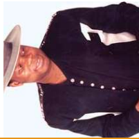
DEMOCRATIC REPUBLIC OF CONGO

An icon of soukous dance and music, the effervescent Kanda burst onto the scene in the mid 80s - and people haven't stopped dancing. His music is irresistibly uplifting and optimistic.