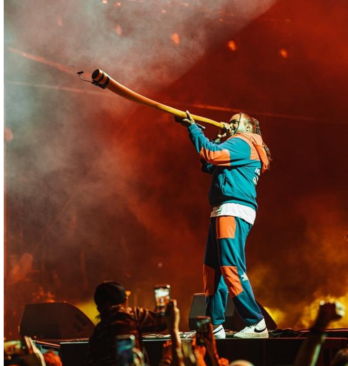
Image: Baker Boy playing the didgeridoo, wearing a blue and orange tracksuit.

There are also pop-up performance locations at Adelaide Botanic High School's gym (The Studio) and the KidZone, as well as roving performances around the park each day. All stages and locations are marked on the map.