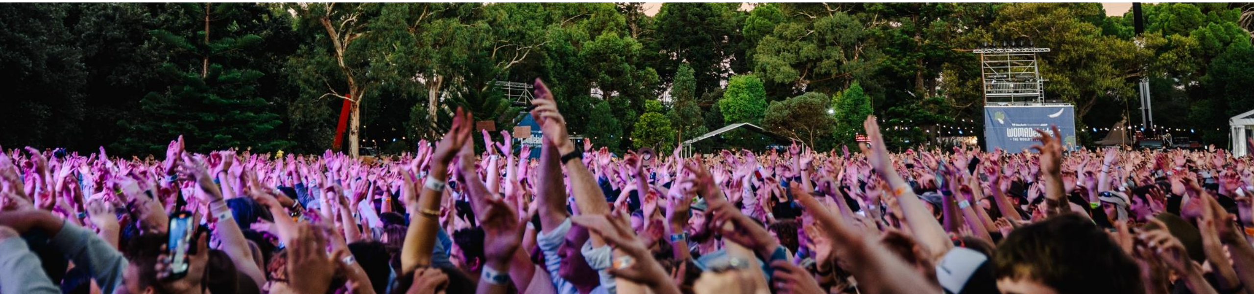
Image: A very large crowd dancing with their hands in the air, with large trees in the background.

If you have feedback on this Access Guide, please let Access2Arts know via hello@access2arts.org.au or by calling (08) 8463 1689.