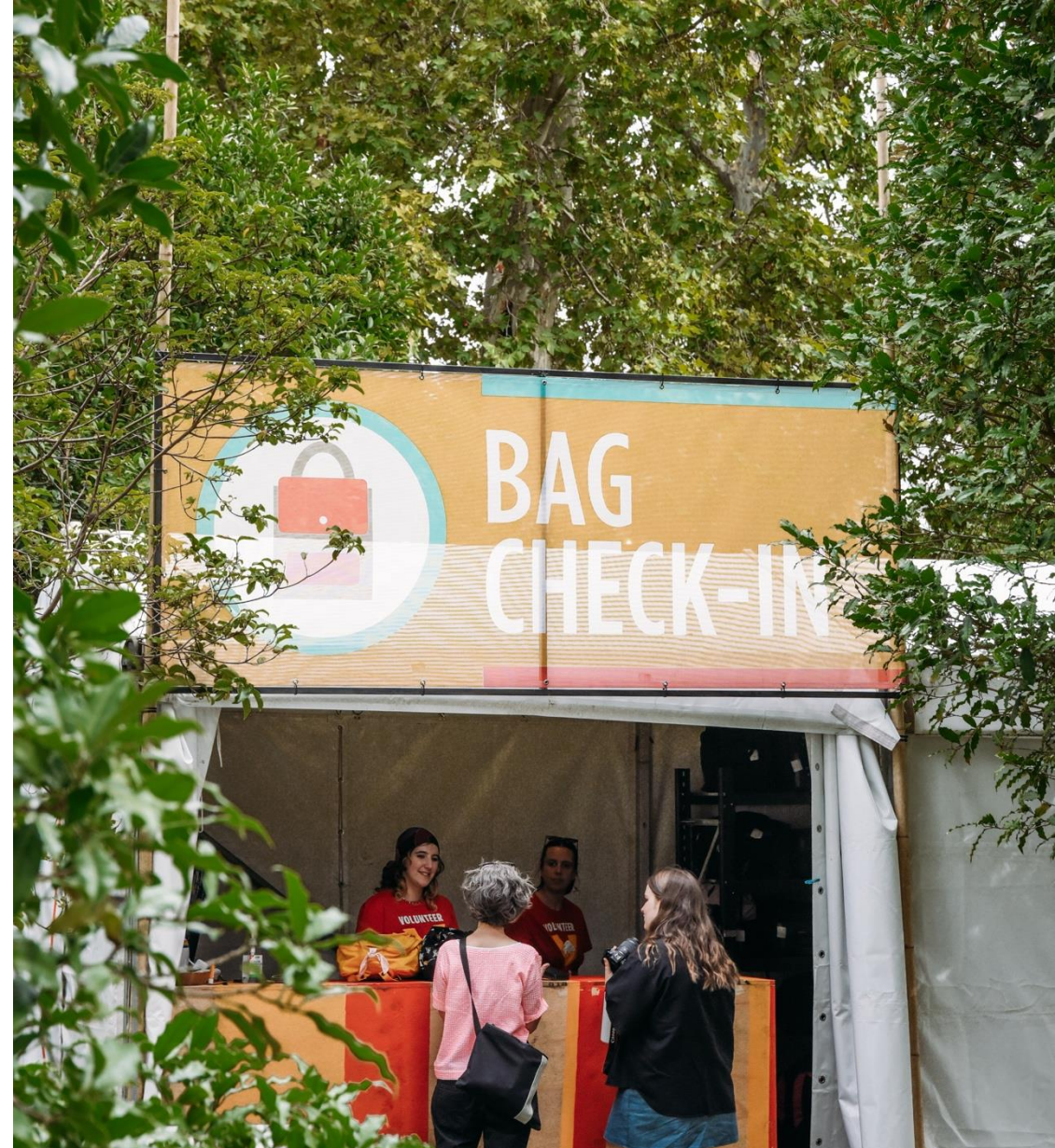
Image: Two people being served at the Bag Check-In.