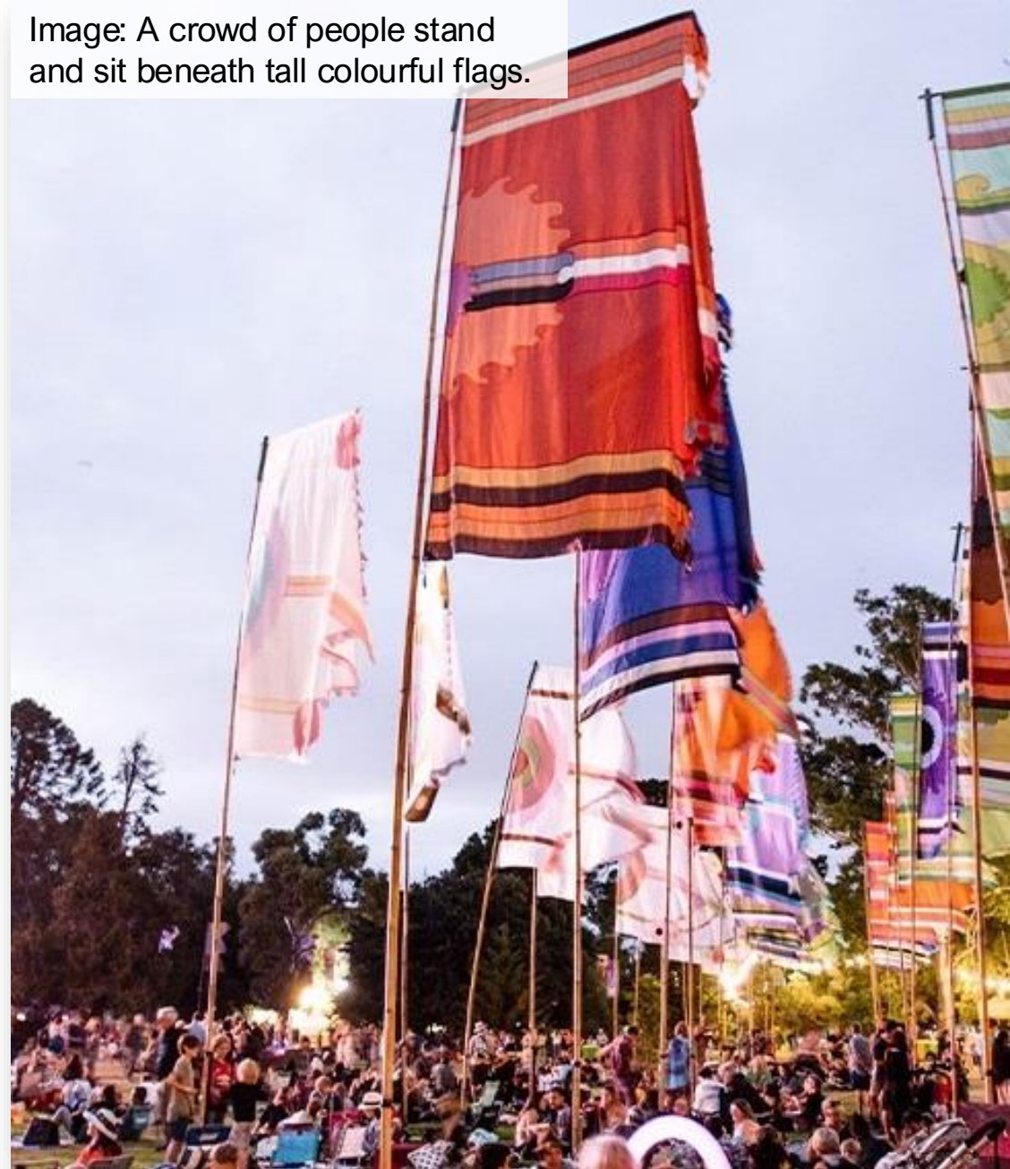
Image: A crowd of people stand and sit beneath tall colourful flags.

If you have any other access questions, please contact tickets@womadelaide.com.au .