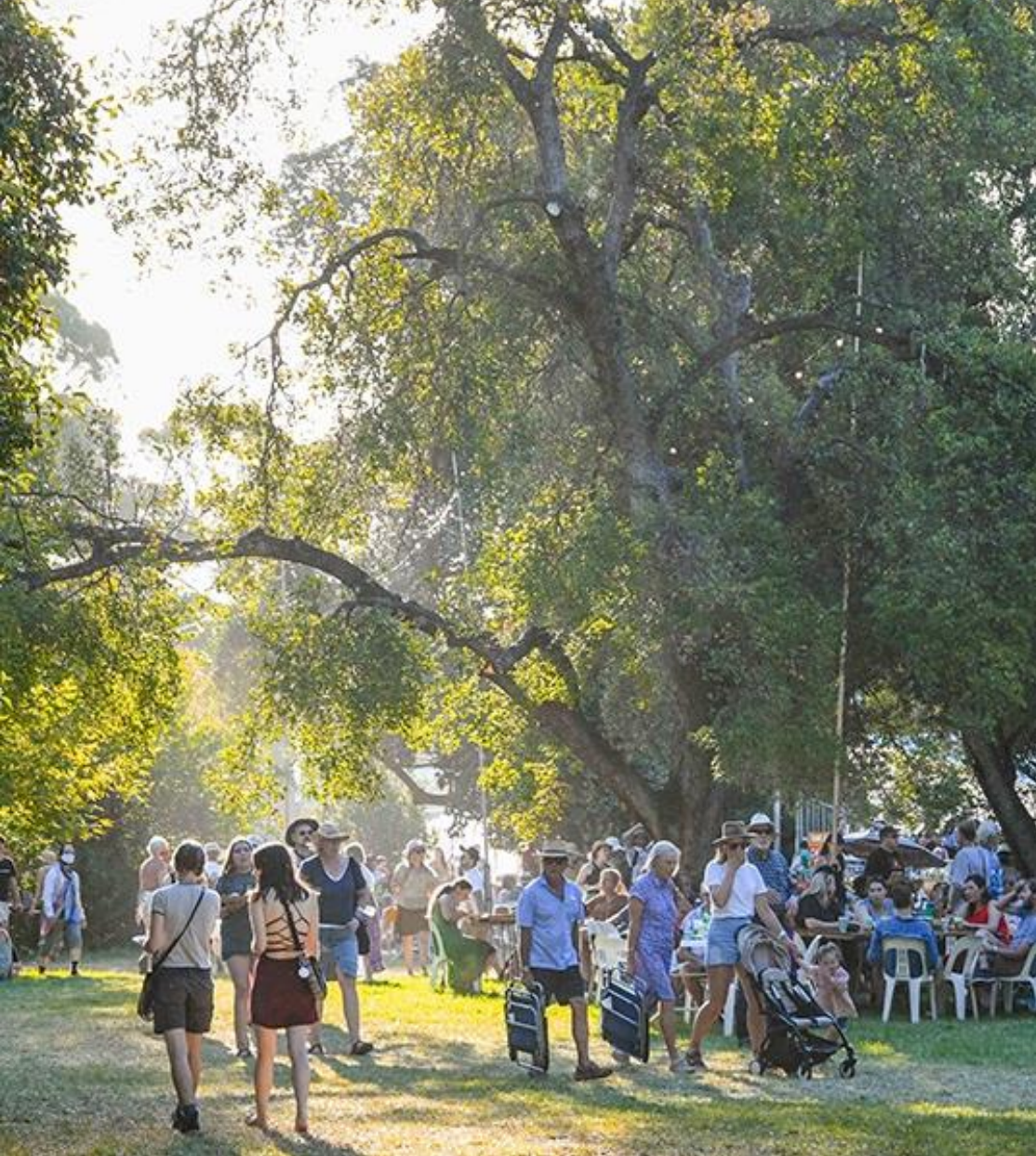
Image: Many people gather under large, leafy trees.