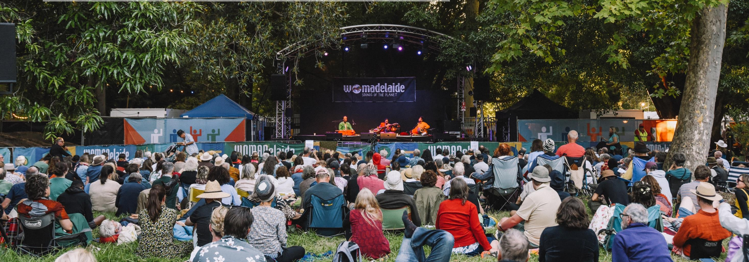
Image: A crowd of people seated on the grass watching a performance under the green leafy trees.