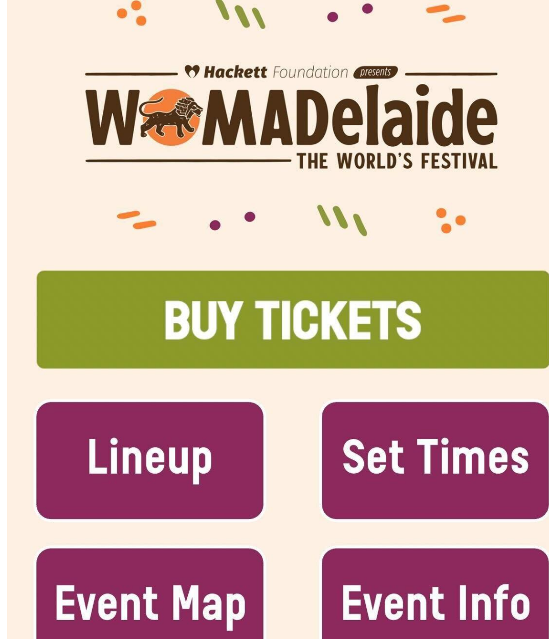
Image: A screenshot of the WOMADelaide 2024 app home screen.

You can also view the site map on page 23 of this guide or download it here .