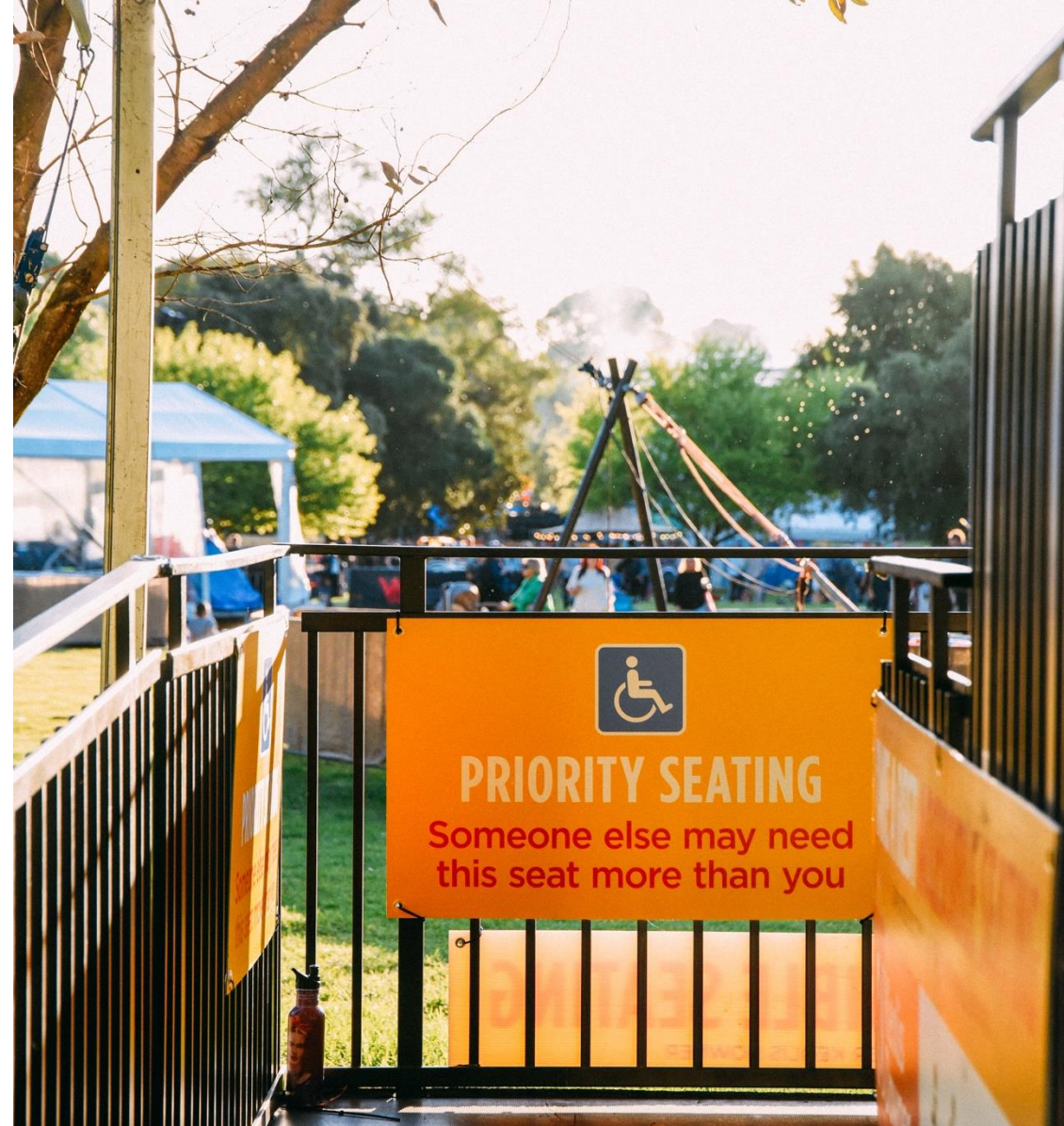
Image: A yellow sign on the access viewing platform that says, 'PRIORITY SEATING – Someone else may need this seat more than you'.

The access platforms can fill up quickly for popular shows, so plan to arrive ahead of time for performances.