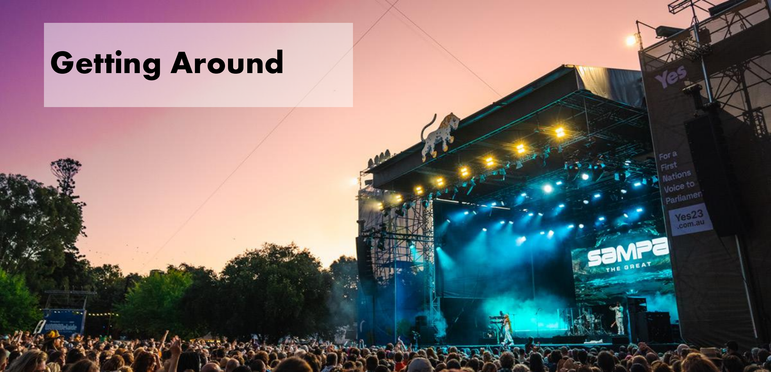
Image: A huge crowd stands in front of a gigantic blue-lit stage under a purple sunset.