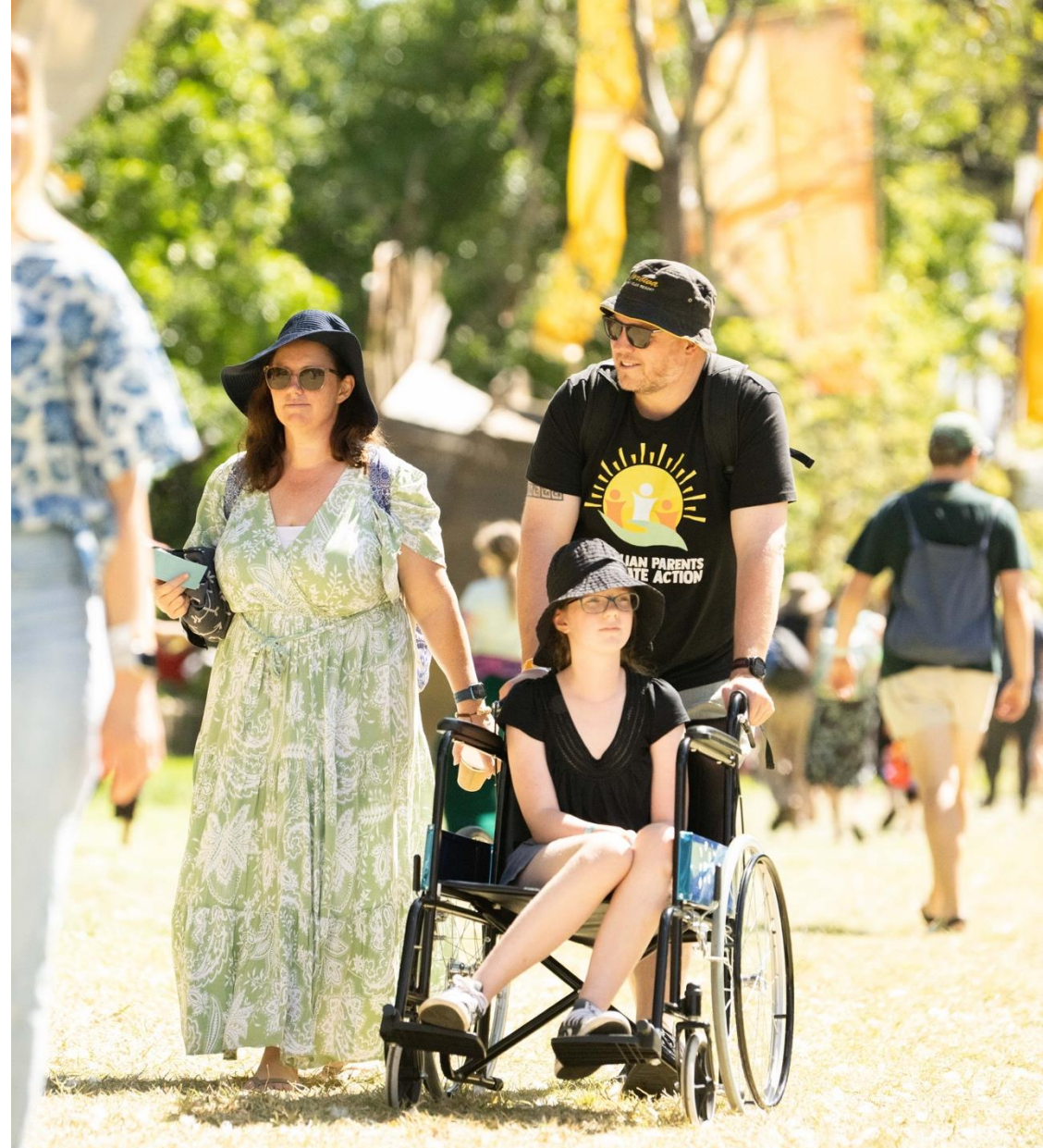
Image: A person being pushed in a wheelchair across the grass.

There are details in the pages following about accessibility for people with asthma, details on the paths and surfaces, sensory information, and other facilities.