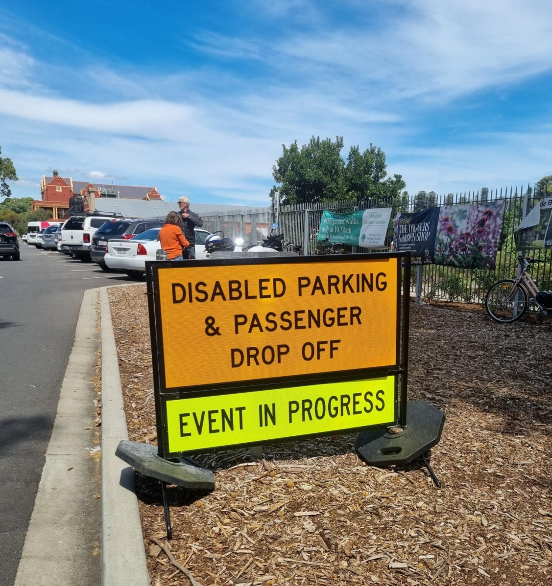
Image: A sign next to a car park reading “Disabled Parking & Passenger Drop Off – Event in Progress”.

Access taxi bookings can be made through Suburban Taxis by calling 1300 360 940.