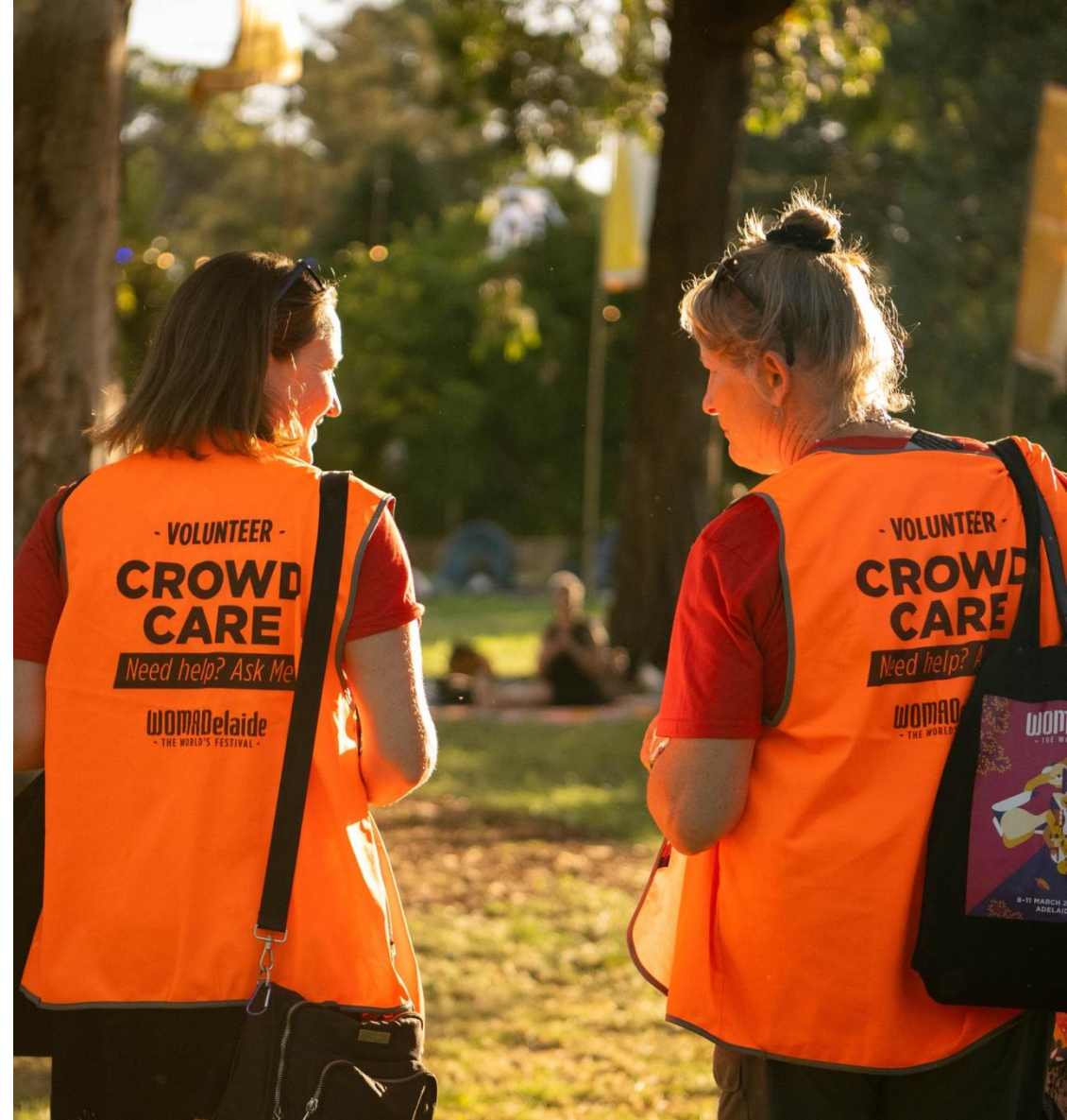
Image: Two volunteers wearing orange vests that say, 'VOLUNTEER – CROWD CARE – Need help? Ask me'.

A select group of volunteers also complete an 'Access All Areas' online training by SupportAct about intervening when witnessing sexual harassment, assault, discrimination and bullying.