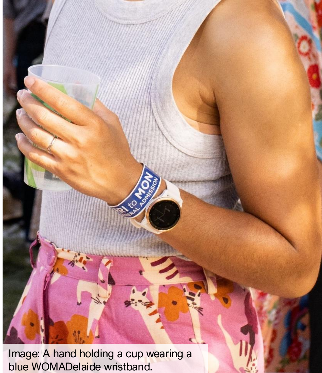
Image: A hand holding a cup wearing a blue WOMADelaide wristband.

To leave and come back, you must scan out and scan in again at the entrances.