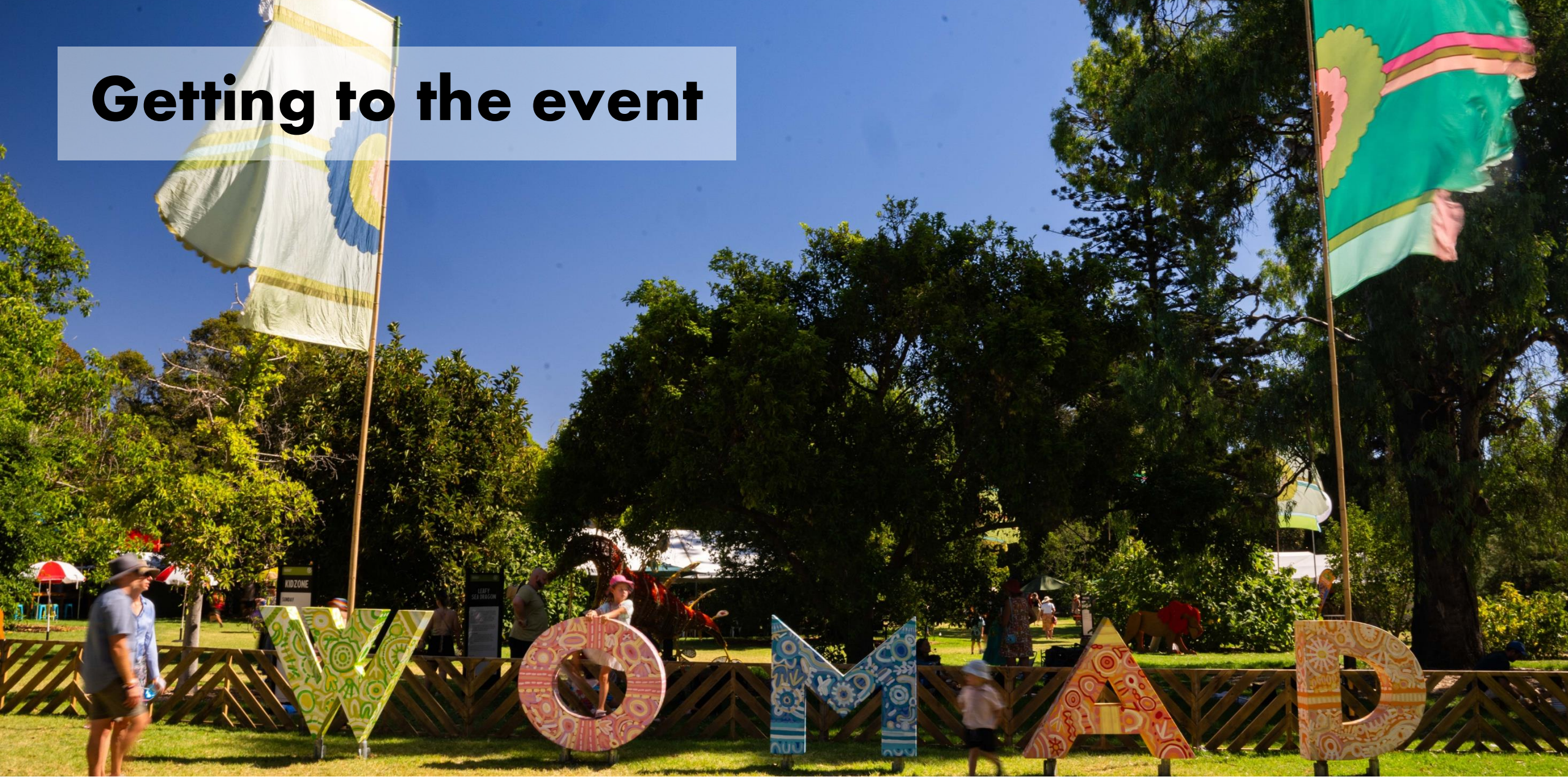
Image: Children playing on sculptural letters that spell “WOMAD”.