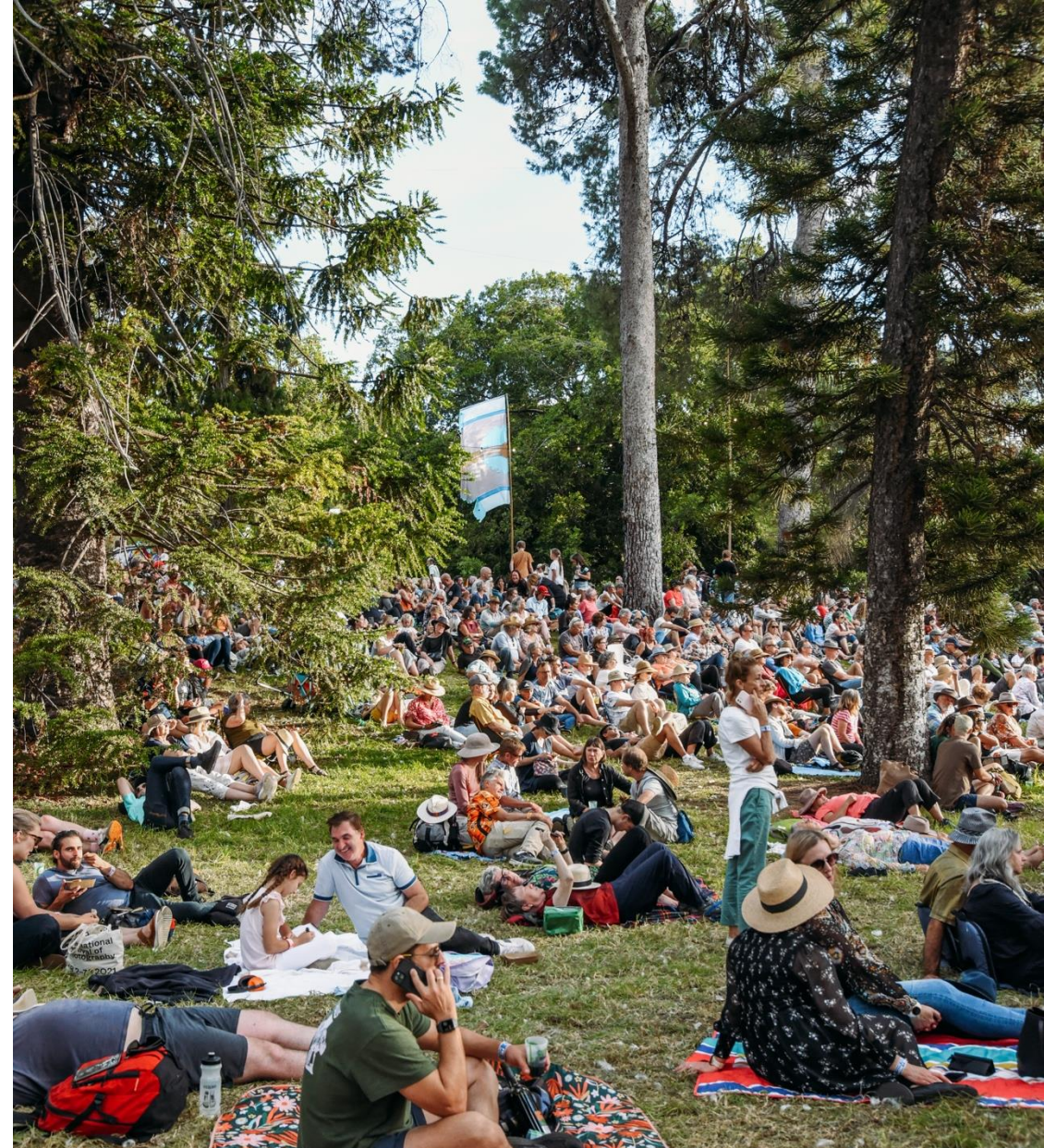
Image: A large crowd of people sitting on the grass on a hill.

Where a sealed pathway is not available to move between areas of the site, an unsealed clearway has been created to assist with moving through the site, this is marked on the map.