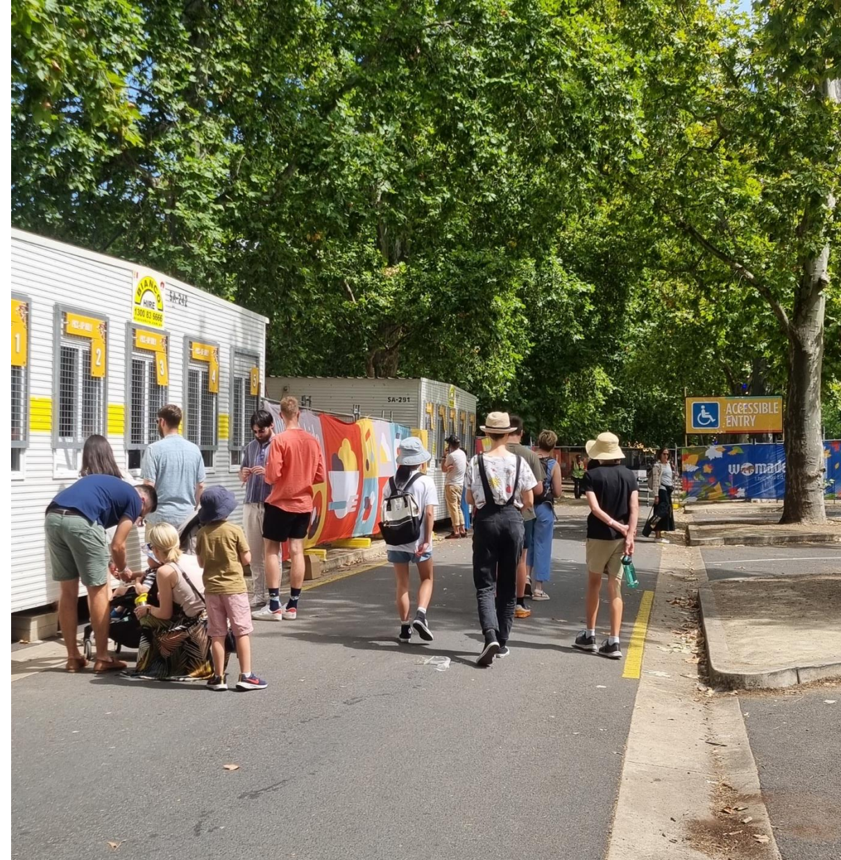
Image: People gather around the Hackney Road entrance.

Both areas have Box Offices, and staff who will scan your wristband and check your bags.