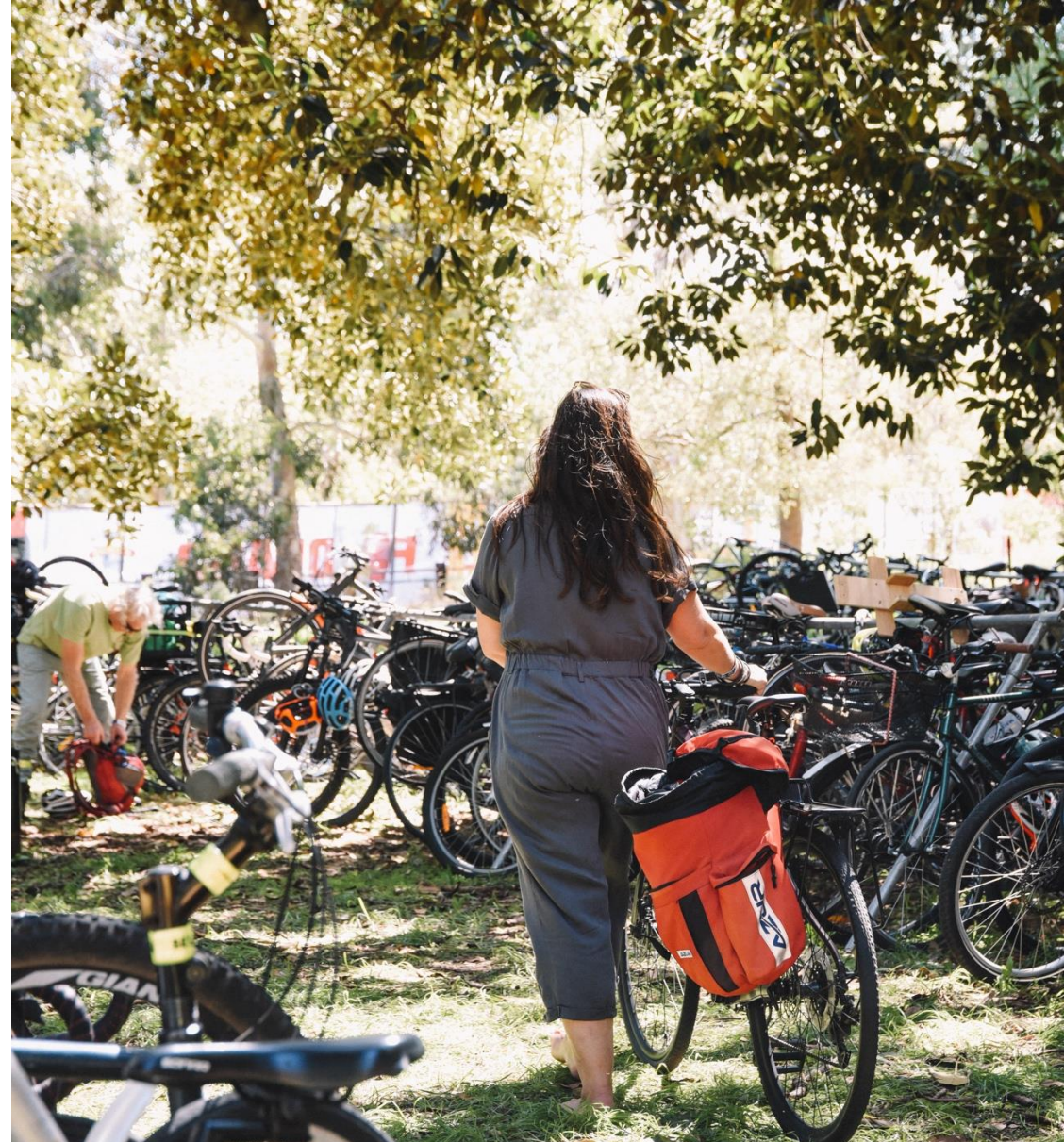
Image: A person walking with a bicycle in a grass area with many other parked bicycles.

City cycling maps are available here with maps 6 and 9 showing access to Botanic Park.