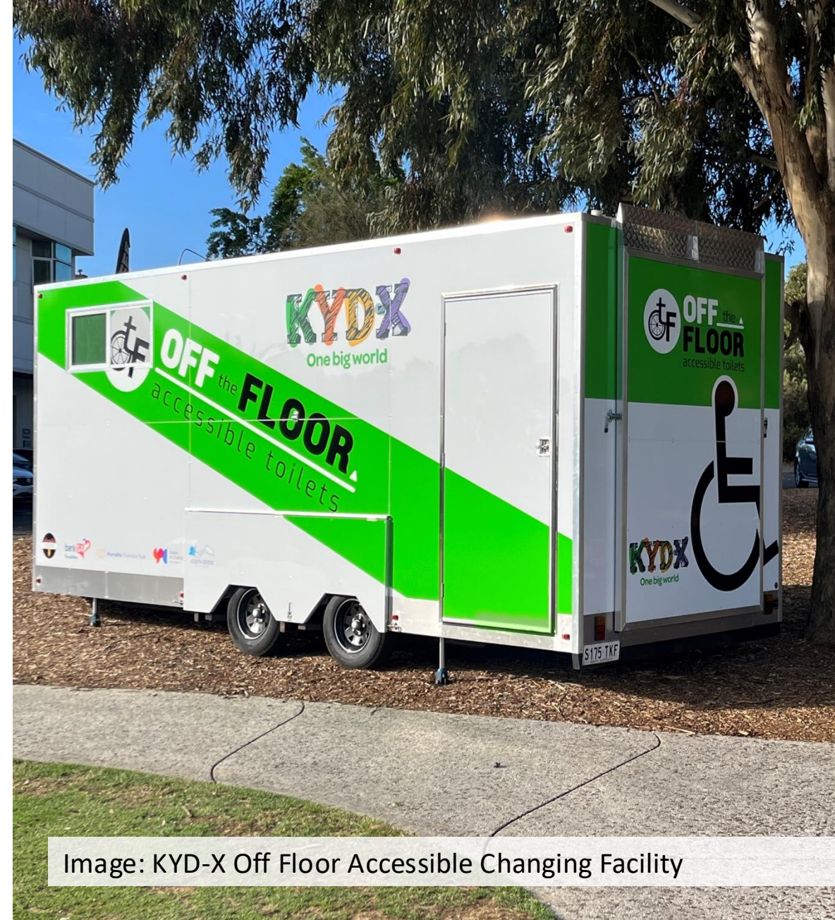
Image: KYD-X Off Floor Accessible Changing Facility

This facility includes ramp access, automatic door entry, adult size change table, and a ceiling hoist, as well as a working toilet.