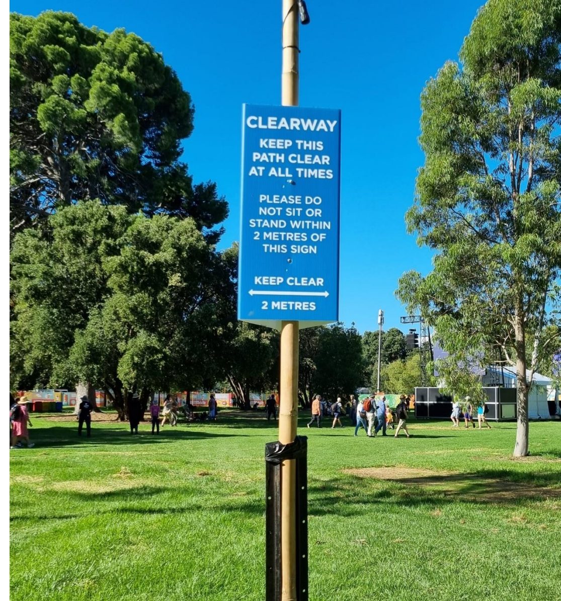
Image: A sign on a pole denotes this grassy area as a 2-metre-wide clearway.

At night the site can get quite dark in areas that are not busy, but there will be lights where the food, bars, toilets, and other amenities are, as well as lights for the path and across the park.