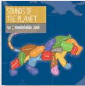
SOUNDS OF THE PLANET WOMADELAIDE 2008