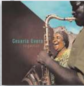
CESARIA EVORA ROGAMAR