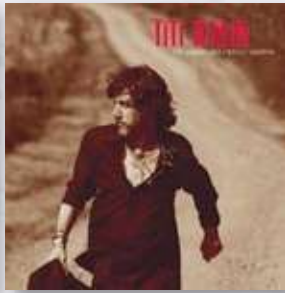
TITI ROBIN CES VAGUES QUE L'AMOUR SOULEVE