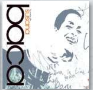
SUSANA BACA BEST OF