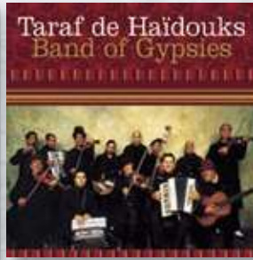
TARAF DE HAIDOUKS BAND OF GYPSIES