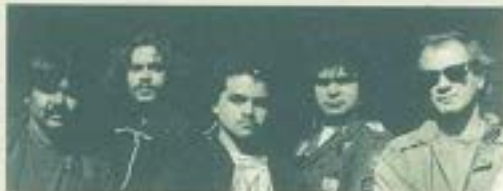
COLOURED STONE APPEARS WITH THE SUPPORT OF FOUNDATION SA

Rock-reggae band Coloured Stone have won audiences from the outback to America, and their sixth album, Inna Jujū , has brought critical